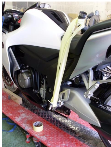
Exhaust strapped to left peg.