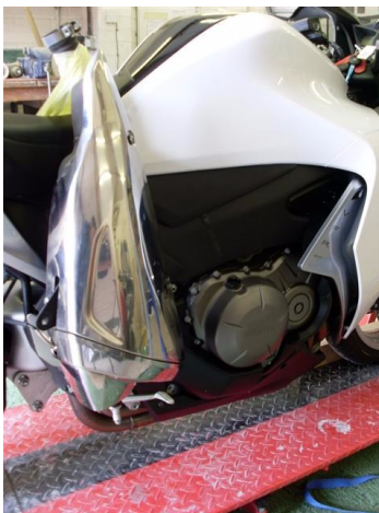
Exhaust stood on peg. Pyramid-plastics.co.uk