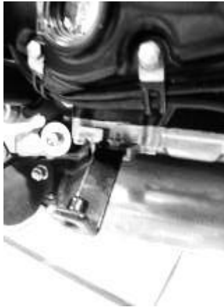
Left side bracket (B)