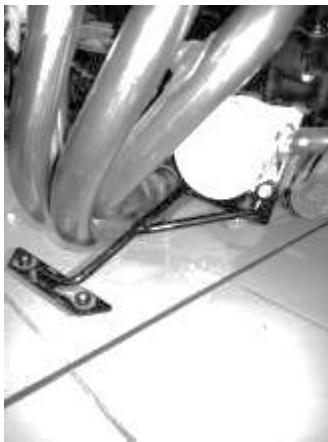
Front mounting bracket (A)