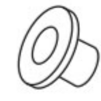
3 Grommet Spacers 4X