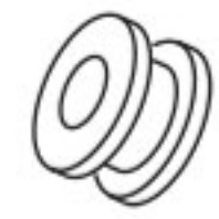
2 Grommets 4X