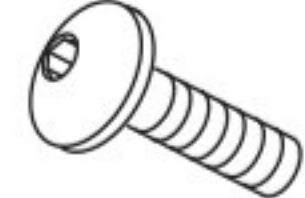
4 M5 X 25 Bolts 4X