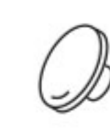
5 Bolt Caps 4X

Please use the detailed fitting diagrams below.